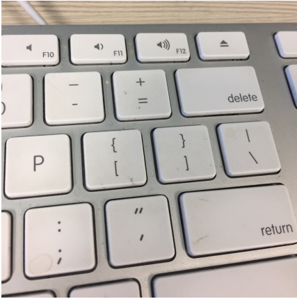
PART II - Entry, Halls, Stairs - Ceilings, Walls -