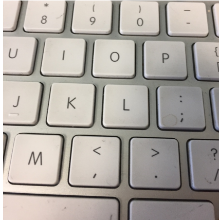
PART II - Living Room, Family Room, Great Room - Ceilings, Walls -